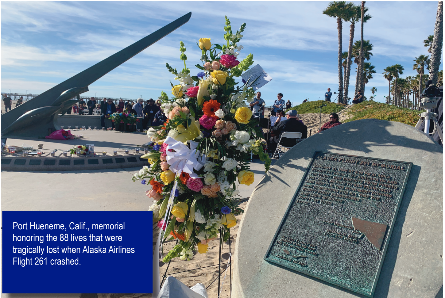
Port Hueneme, Calif., memorial honoring the 88 lives that were tragically lost when Alaska Airlines Flight 261 crashed.